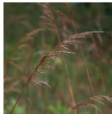
Indiangrass Sorghastrum nutans

Perennial grass Height: 3-8' Blooms: yellow August - October Sun or shade Grows in clumps Seeds for small mammals and birds – nesting materials Larval host for skipper butterflies Deer resistant