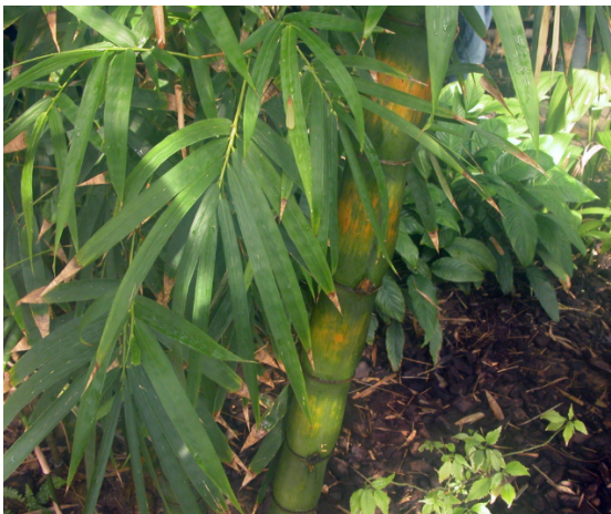
Golden Bamboo - Phyllostachys aurea

Often planted to create or enhance privacy Used to create visual as well as noise barriers Fast-growing, woody rhizomatous perennial grass Adds 3-4' of new growth a year Forms dense monoculture that suffocates native plants thereby altering the whole ecosystem