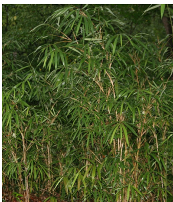
Giant Cane, American Bamboo Arundinaria gigantea

Evergreen perennial grass Height: 3-6' Blooms: green February - May Part shade Attracts birds and butterflies Larval host to many insect species Benefits wildlife, including warblers, turkeys, rabbits, deer and many others