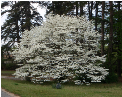
Flowering Dogwood Cornus florida

15-20' deciduous tree, single or multiple trunk, 15-30' spreading crown