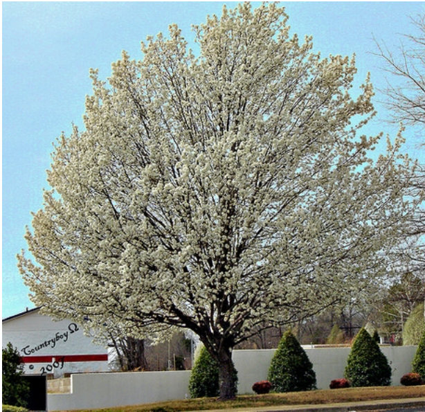
Bradford or Callery Pear – Pyrus calleryana

Planted as a popular flowering urban and suburban landscape tree