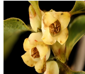
Common Persimmon Diospyros virginiana

15-100' deciduous tree, 25-35' spreading crown, pendulous branches