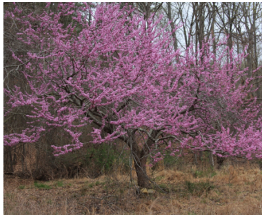
Eastern Redbud Cercis canadensis

15-35' deciduous tree, one to several trunks, 15-35' umbrella-like crown